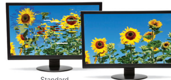
Standard Amplifiers 3 dB typical